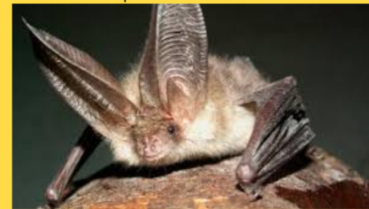
Long-eared bat ( Myotis septentrionalis )

Visit the National Wildlife Federation "Native Plant Finder" online to pick the best native species for your garden!