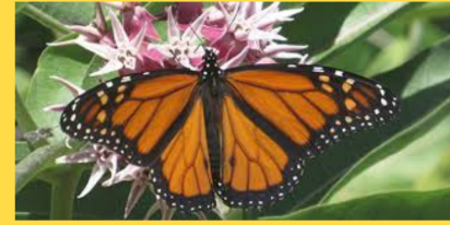
Western monarch ( Danaus plexippus )