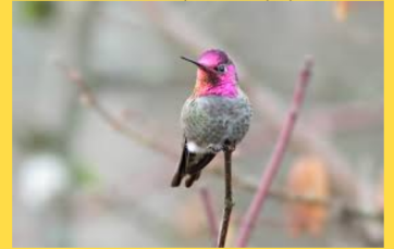
Anna's hummingbird ( Calypte anna )