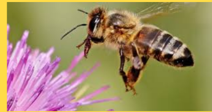
Honey bees ( Apis mellifera )