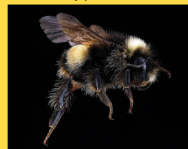
Yellow-banded bumble bee ( B. terricola )