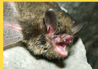
Long-eared bat ( Myotis septentrionalis )

Visit the National Wildlife Federation "Native Plant Finder" online to pick the best native species for your garden!