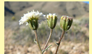
Esteve's Pincushion ( Chaenactis Stevioides )