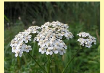
Common yarrow ( Achillea millefolium )

Other alternatives: Hairy false goldenaster ( Heterotheca villosa ) Hoary tansyaster ( Machaeranthera canescens )