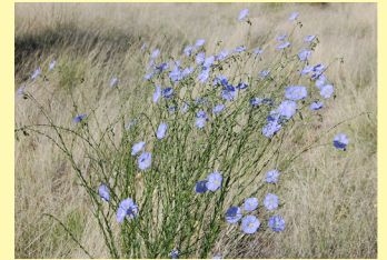
Blue flax ( Linum lewisii )