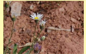
Eaton's fleabane ( Erigeron eatonii )